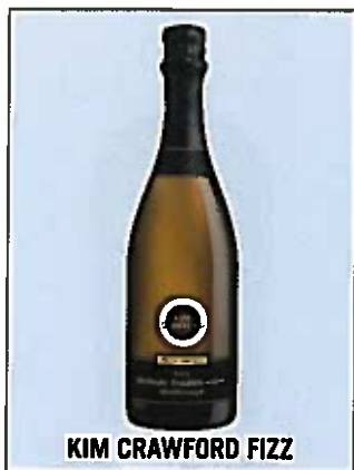
KIM CRAWFORD FIZZ

Princeton, Minnesota-based Prestige Wine Group began importing a new Prosecco in September. Made from 100-percent Glera grapes, the 2012 Canti Prosecco DOC Millesimato ($13.99 a 750-ml. bottle) is medium-dry and crisp, with peach and pear flavors.