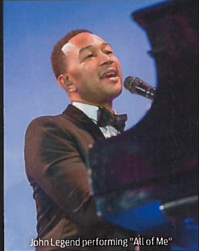
John Legend performing "All of Me"